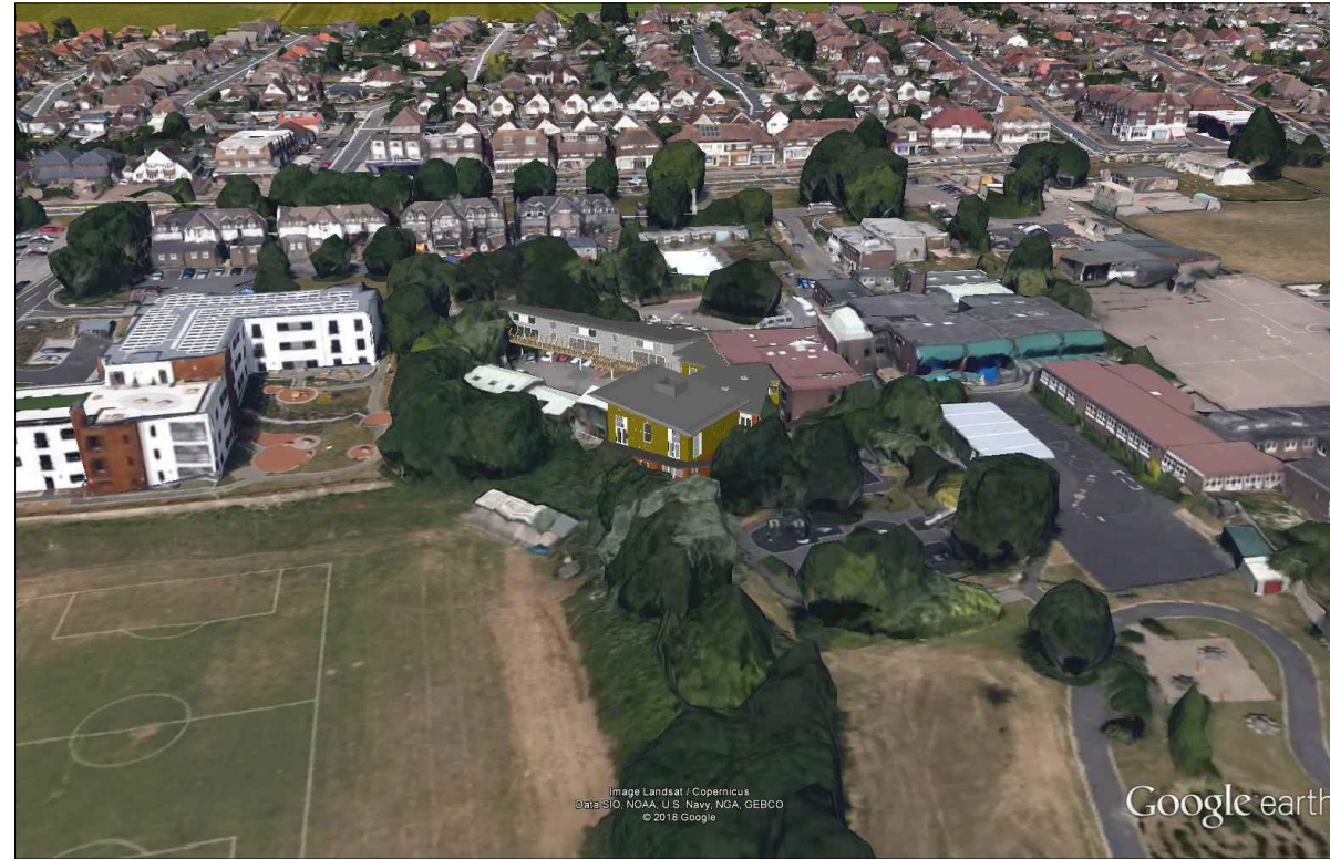
View 2 from South