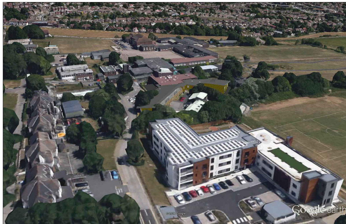
View 3 from West