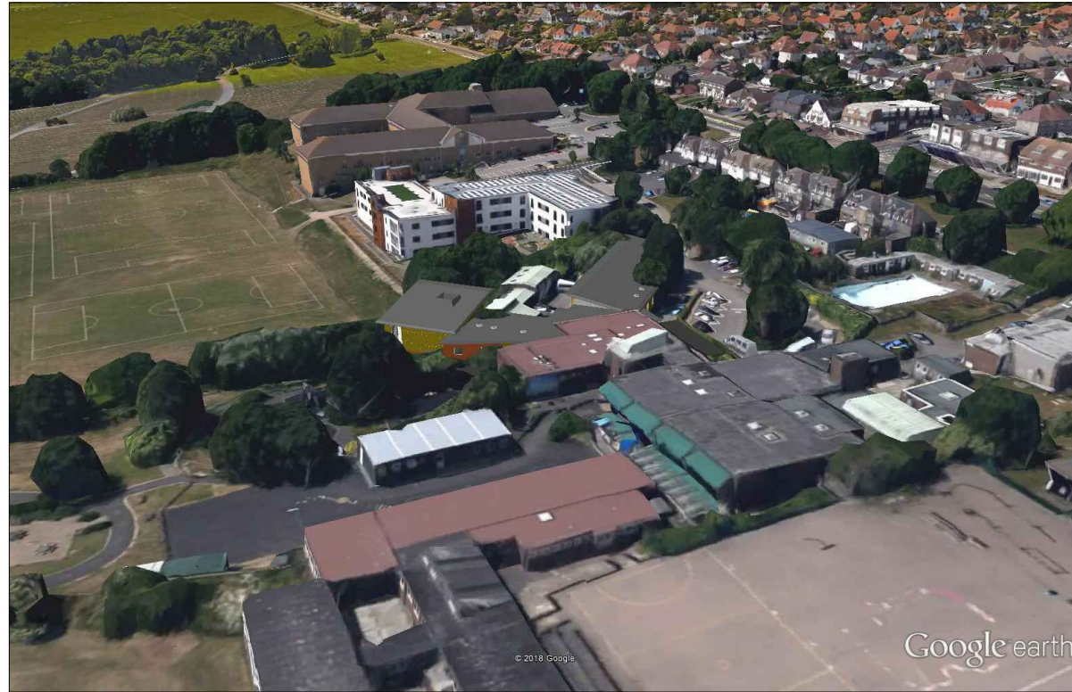
View 1 from East